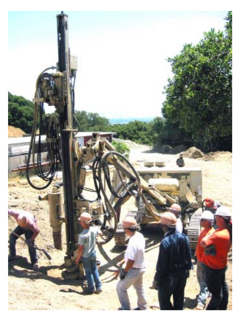
Trainees take turns to learn how to use an Air Track Drilling rig.

Hemstock jokes that an Air Track Drilling rig is "basically a large jackhammer on tracks," but he